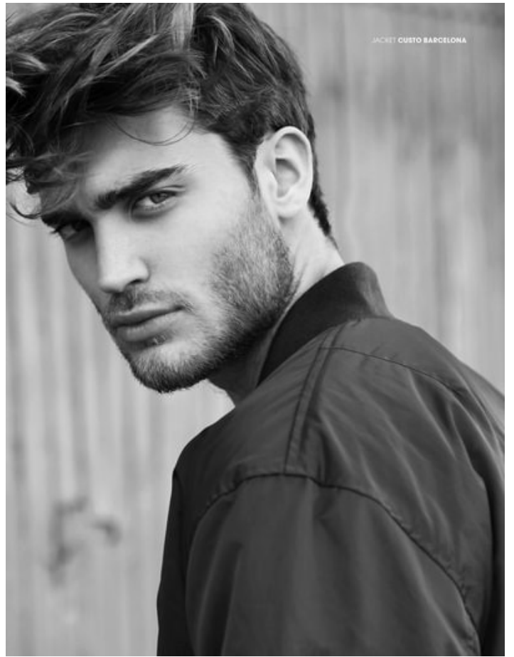
JACKET CUSTO BARCELONA